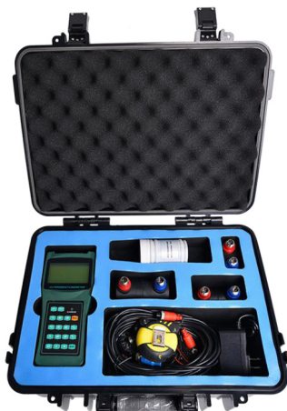
Standard type clip box